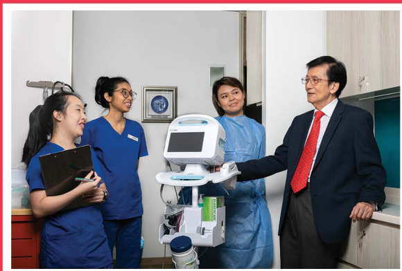
Compassionate and Competent Service