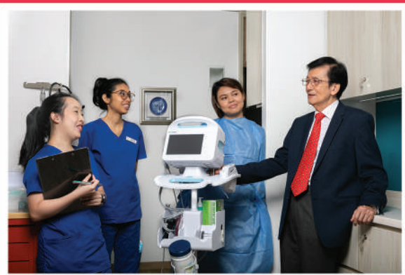
Compassionate and Competent Service