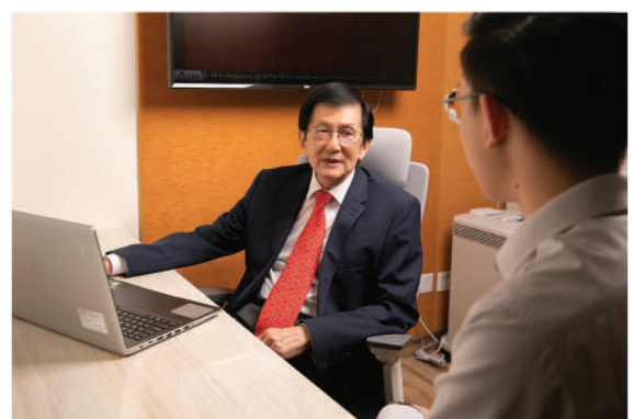
Consultations With Qualified & Experienced Cancer Specialists (Medical Oncology & Haematology)